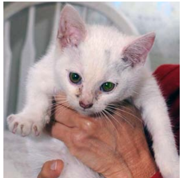
Most rescue shelters have dogs and cats available.